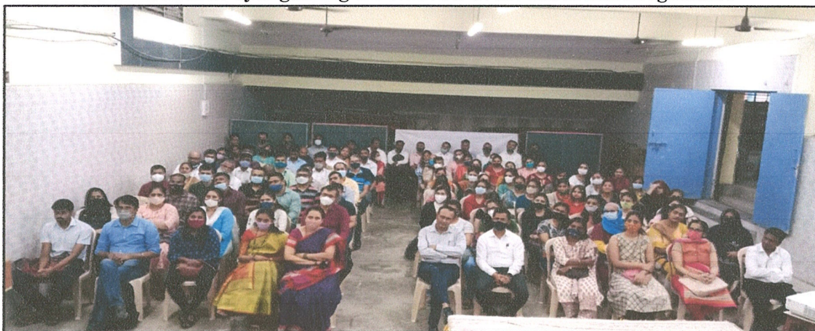
Students, Teachers and Other Stakeholders at the Programme in Attendance